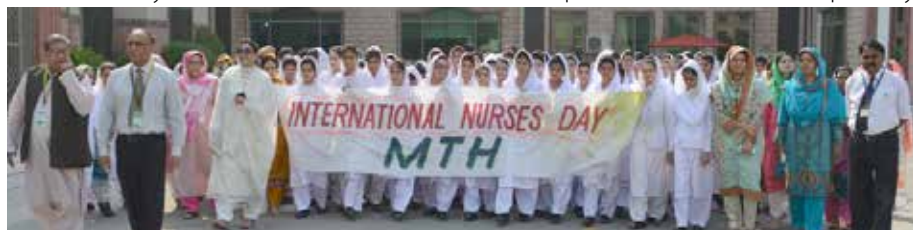
Senior Administration, staff and students of School of Nursing, MTH displaying banners to mark International Nurses Day