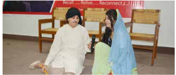
Students performing skit

A series of colorful programs and performances were given by MBBS and BDS students. The Alumnae shared their experiences and expressed their heartfelt gratitude to the Association for providing this grand platform and a great opportunity to interact with Alumnae, faculty and present students.