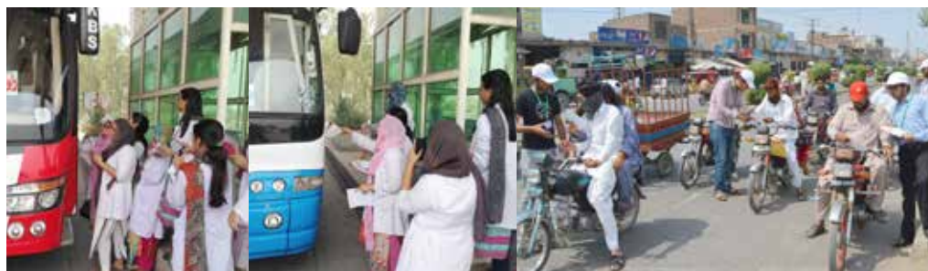
Anti Dengue Campaign- TUFIUANS distributing flyers for public awareness