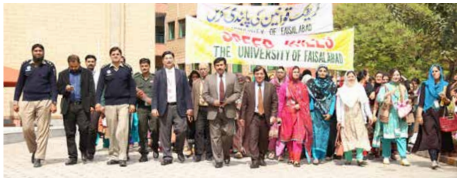
Faculty members and students of TUF and UMDC participating in awareness walk