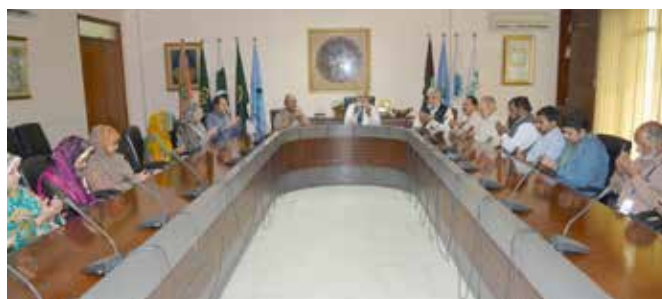
Faculty members and staff offering "Fateha"