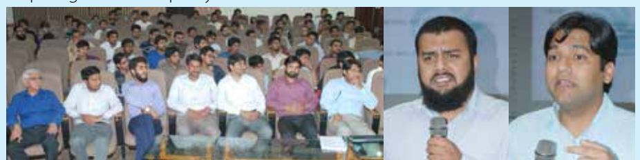
Guest speakers addressing the audience

test laid down by the industries for selection of Engineering graduates to serve the Nation.