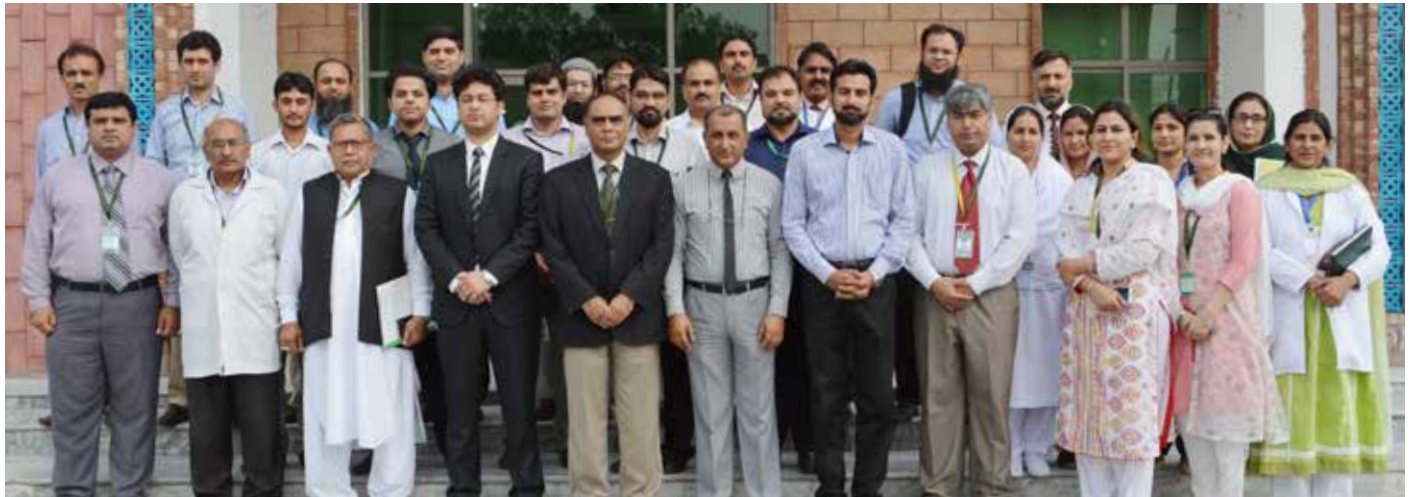
Group Photo of Senior administration and staff of MTH with external auditors' team