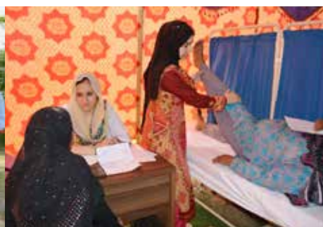
Patients are being treated