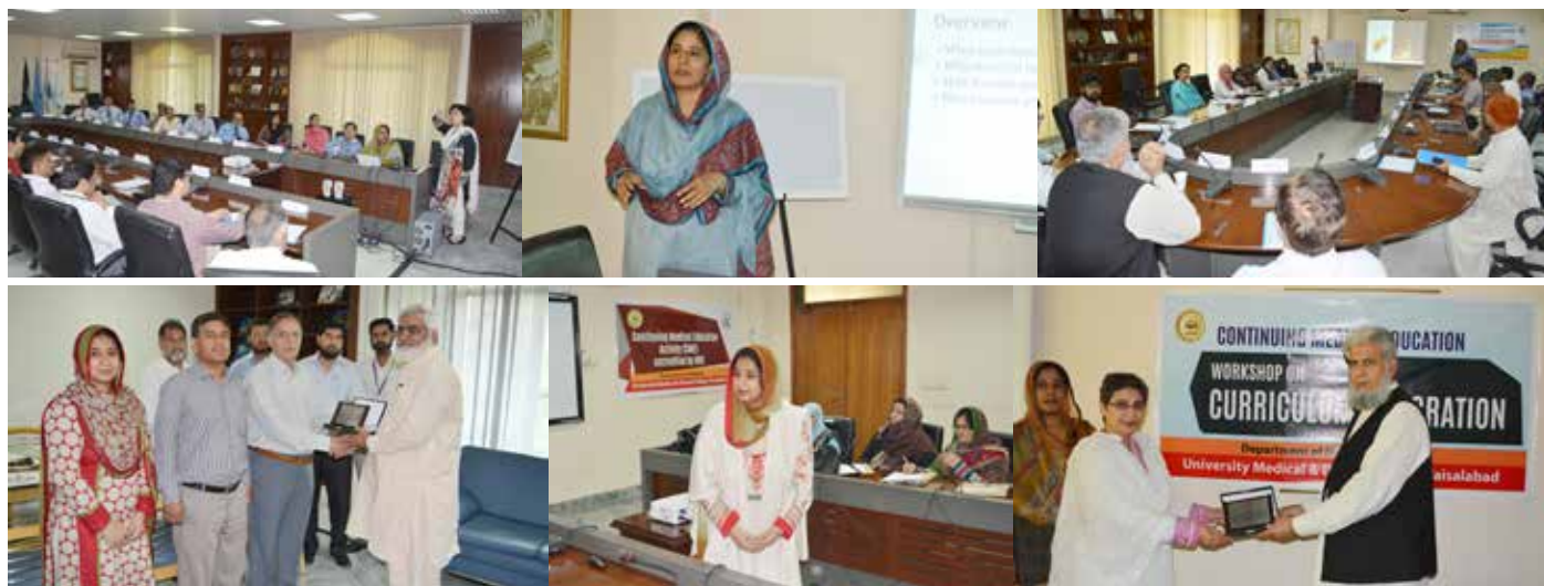
Glimpses of CME workshops at UMDC

A workshop on curriculum integration was organized by Department of Medical Education, UMDC on 9th of May, 2015 for capacity building of faculty members of University Medical College for upcoming curricular reforms. Prof.