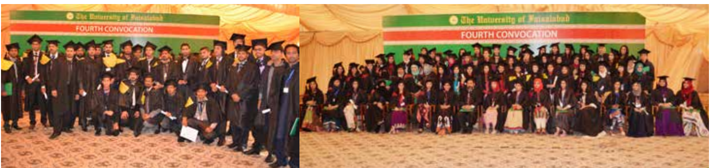
Group photos of Graduates