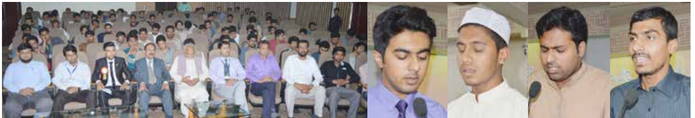
Students participating in Qiraat and Naat competitions