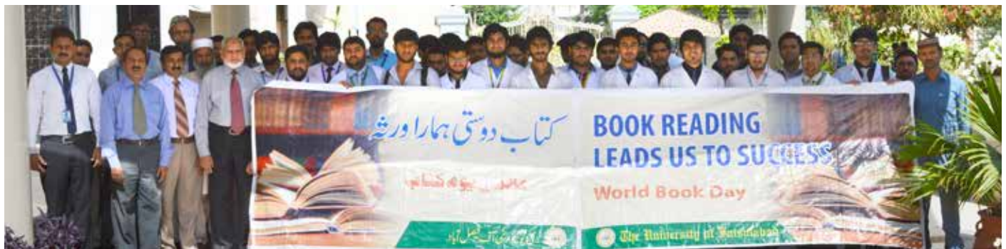
TUFIANS participating in awareness walk to mark World Book Day at Amin campus