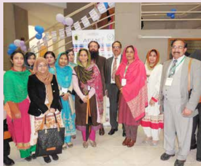
UMDC faculty members at AEME Conference