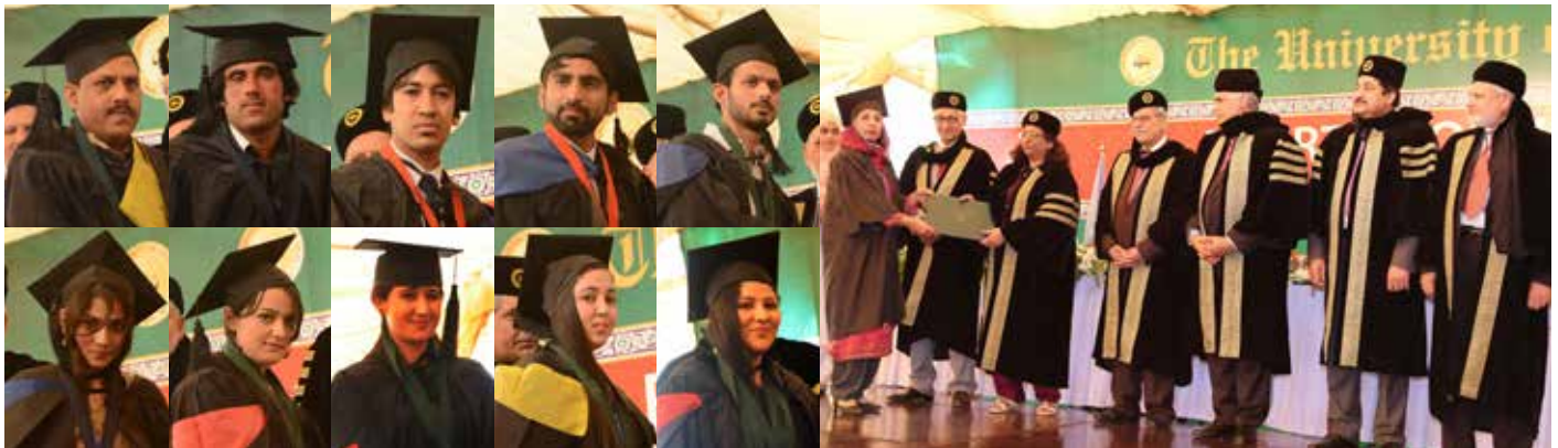
Graduates being awarded medals and degrees