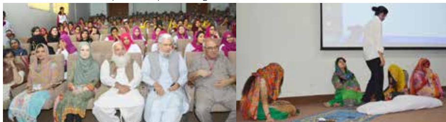
Students performing a tableau depicting importance of family in one's life

on the rights of children as well as the responsibilities of each family member. The guests appreciated the students for their efforts.