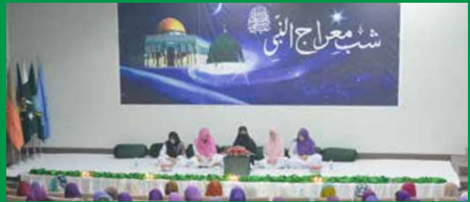
Faculty members and students in program to commemorate the Shab e Meraj un Nabi (SAW)