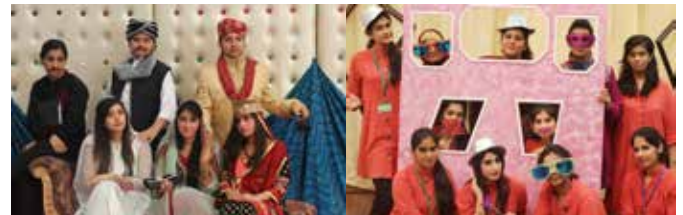
Students of BBA performing in “Pick a Prop, Strike a Pose”.