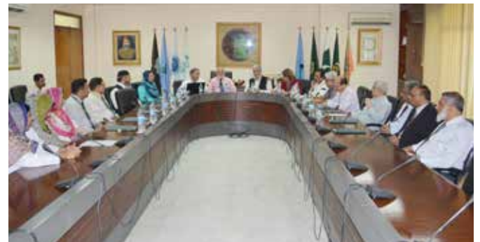
Members of CPSP team during the meeting with faculty members of UMDC in conference room