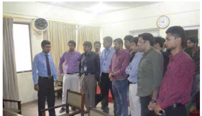
Faculty members and Students of Management Studies visit WAPDA Staff College Islamabad