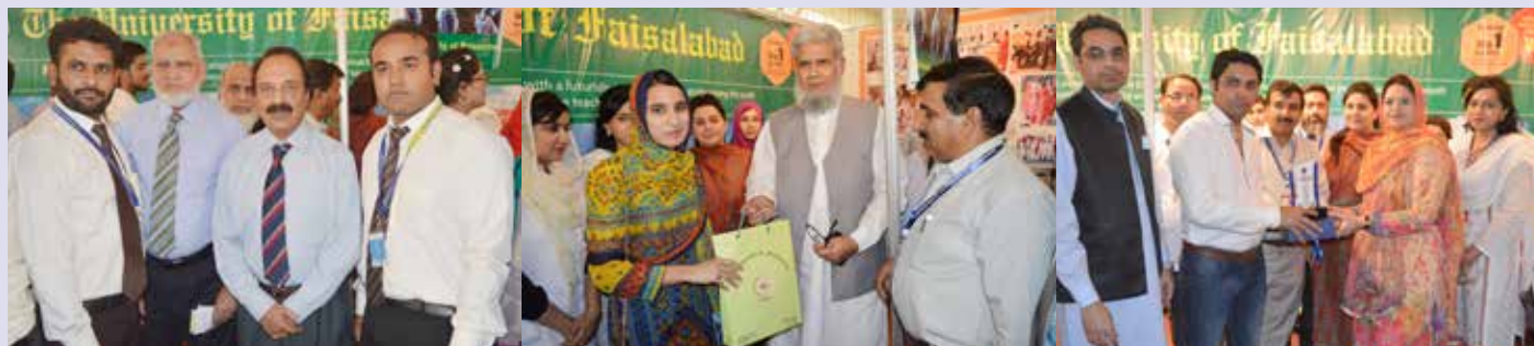
Faculty members and students at University stall during Education Expo 2015

A large number of students/parents visited the stall. Students showed deep interest in courses being offered at TUF. More than a thousand people visited TUF stall of which a sizeable number also showed interest in seeking admission at TUF in the upcoming academic year.