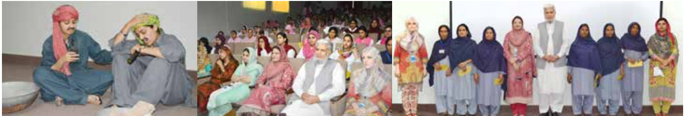
Students performing a skit to mark World Labour Day.