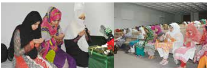
Participants offering Prayer