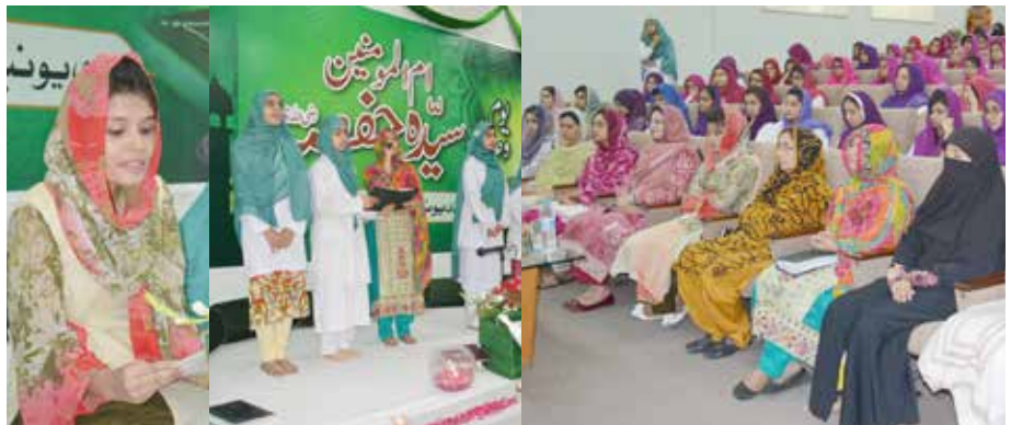
Participants offering Dood o Salam