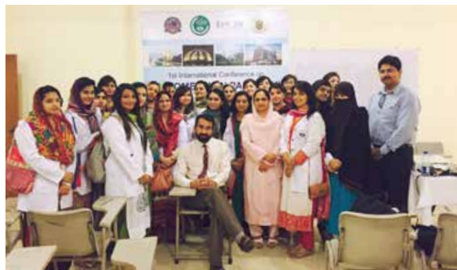
Faculty members and students of School of Optometry in Conference