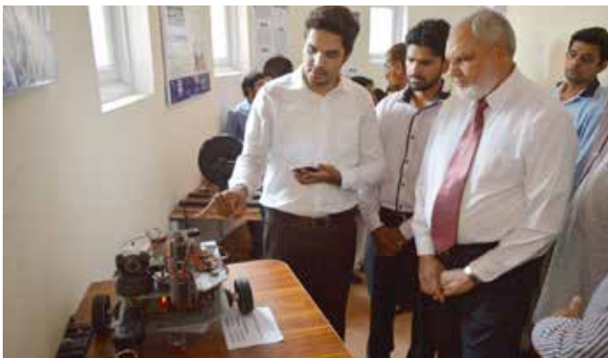
Project Exhibition by final year students of Electrical Engineering