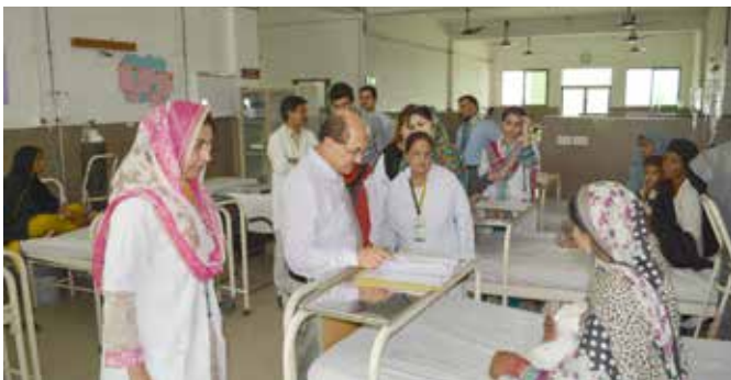
Members of CPSP team during the visit of Madinah Teaching Hospital