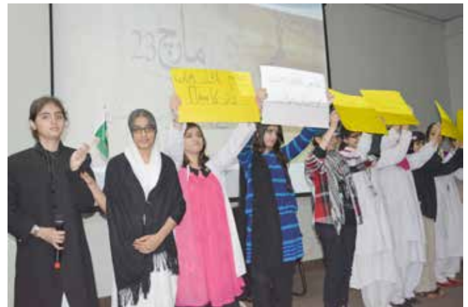
Students performing a skit on Pakistan Resolution Day celebrations at Saleem Campus