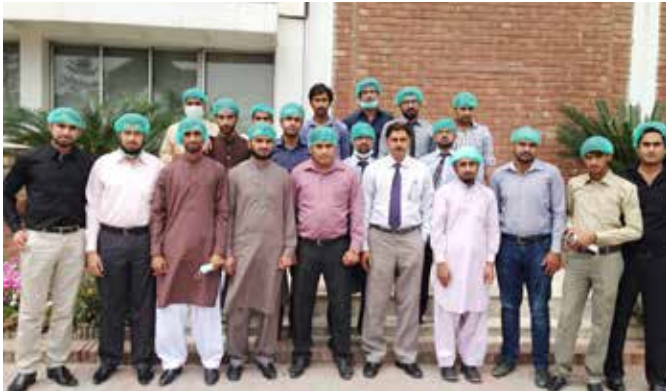
Students of Pharm D visit the Pacific Pharmaceuticals (Ltd) Lahore