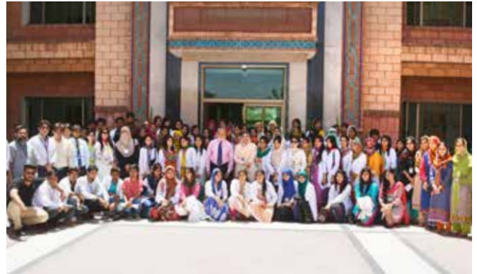
Faculty member & Students of Physical Therapy Department University of Sargodha visit The University of Faisalabad