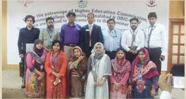
Group Photo of the participants of seminar