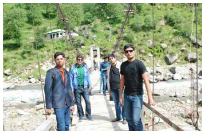
Faculty members and students of Management Studies during their excursion tour of Naraan