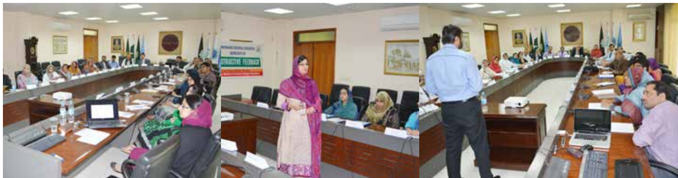
CME workshops in progress, in Conference Room of UMDC

likely to be faced by any faculty undertaking curricular change. She motivated the participants with practical solutions to such issues.