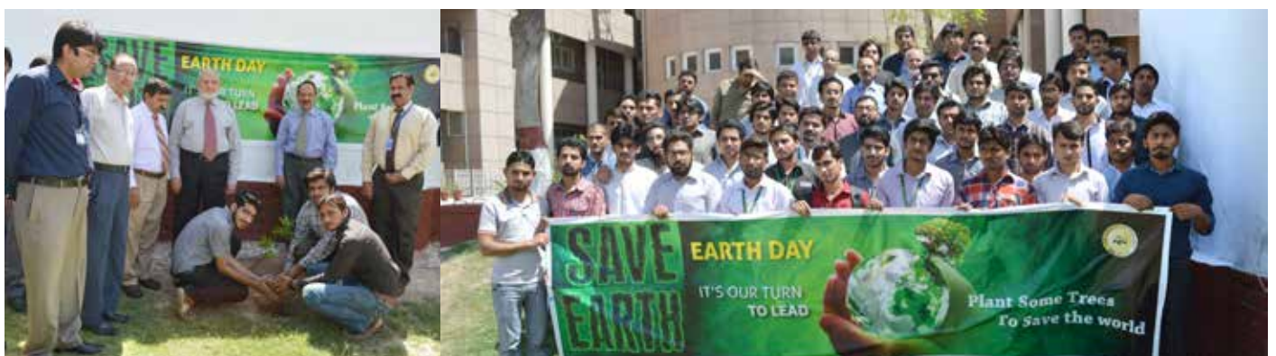
TUFIANS planting a sapling in University lawn