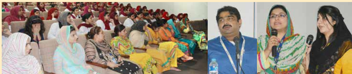
Experts from Metro Cash & Carry delivering lectures in Saleem Auditorium

professional is one of its essential requirements. The University of Faisalabad organized a Workshop on Professional CV writing and Interview coaching in collaboration with Metro Cash & Carry on June 4, 2015. Students from different Schools of TUF were exposed to an insight towards Job Market, CV and Interview skills followed by a small interesting activity.