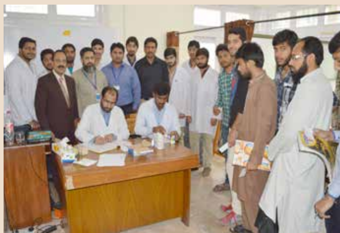
Students are being screened at blood testing camp at Amin campus

A team from (MTH) Madina Teaching Hospital visited Amin campus and took the blood samples from students for checking blood groups. Faculty members as well as a large number of students attended the camp and appreciated the efforts by TUF. A total of 107 students got their blood group checked in this activity. The objective of this exercise was to motivate the community comprising students and faculty members to generate work, which will uplift morals to a higher standard. In addition, this practice will also enhance the ethical and professional values within themselves and foster the sense of responsibility for blood donation and rehabilitation for the needy ones in the entire community.